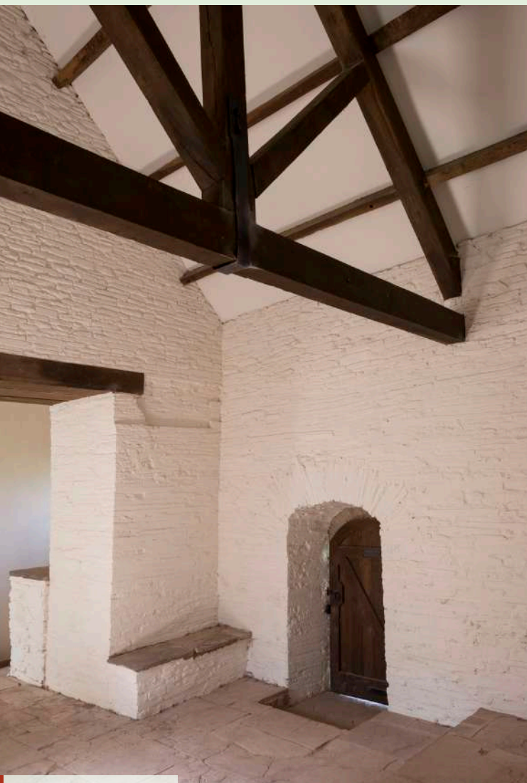
North door of the chancel