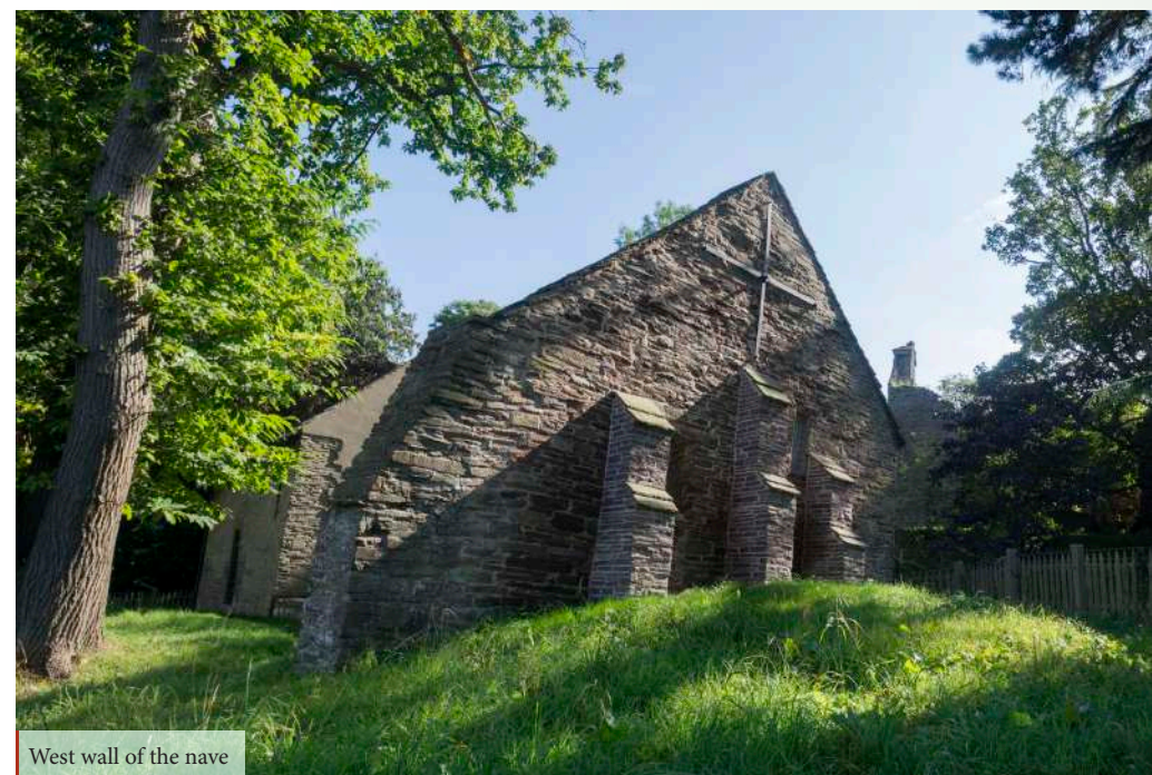
West wall of the nave