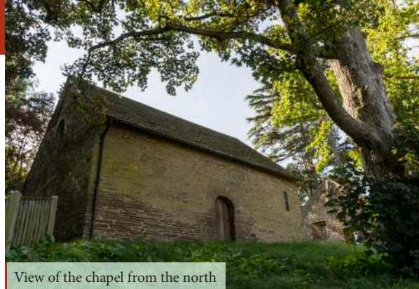
View of the chapel from the north

With the chapel falling into ruin, most furnishings and fittings disappeared or simply rotted.