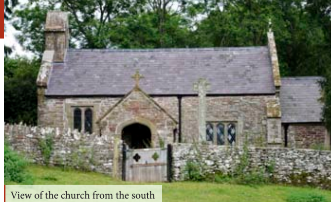
View of the church from the south

In the chancel is a 13 th -century 'dugout' chest (hollowed out from a large tree-trunk) with remains of clasps and lock-plate. There is also an iron 'register chest' where the church records would once have been kept. It has a female figure on its lid. Many such chests were made at the ironworks at Coalbrookdale, Shropshire in the late 18 th and early 19 th centuries. The font, with its octagonal bowl and curved sides, is 13 th -century. The fine wooden pulpit is richly carved with arabesque (geometrical) panels, one of which has the date '1632' and another with initials and date 'I.G.1745': it seems to have been made up from various pieces of wood with the back panel being part of a former box-pew.